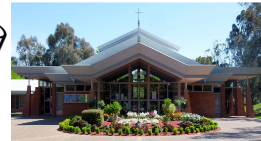
St Michael's Church Tyrrell Cct Kaleen

Office Hours: Tuesday & Thursday 10:00-13:00 Wednesday & Friday 09:30-12:30